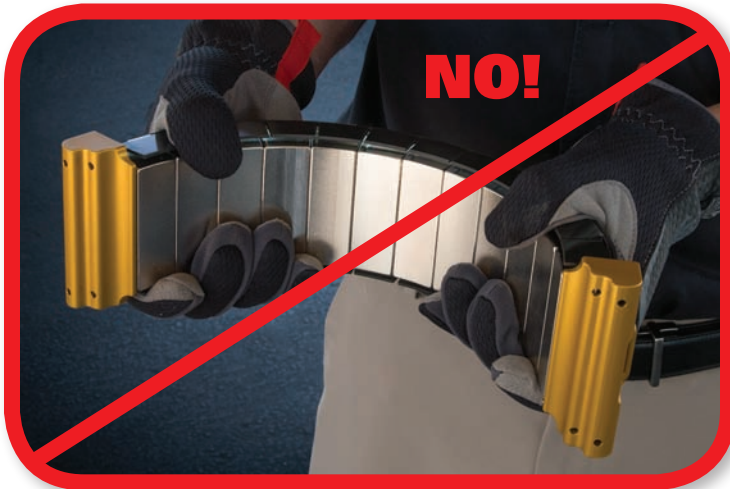
Don't let your fingers get between the magnets and the filter housing or serious injury could result.